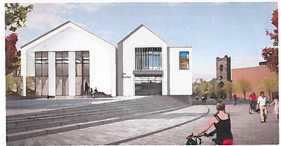
Photomontage looking East