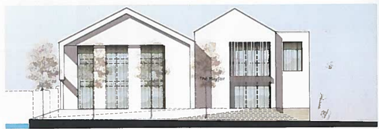
Proposed Western Elevation (Facing Watergate Square)