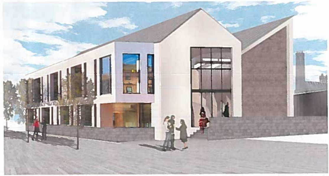
Photomontage looking East