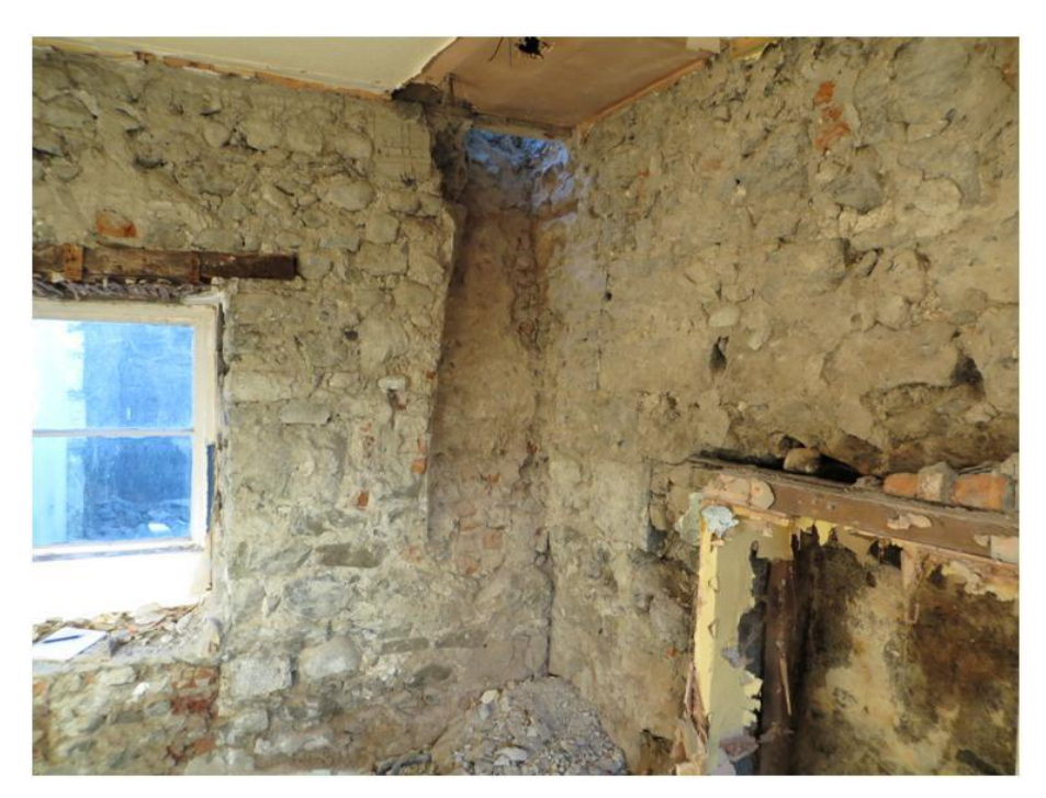
Plate 7: Feature in corner of main ground floor room, 22 Vicar Street

When the render was stripped from the internal walls a feature appeared in the rear corner of the main room on the ground floor of number 22 Vicar Street. This was an area of brickwork on the face of the wall that narrowed towards the top. The brick did not run down to floor level, but stopped a little above the height of the window sill.