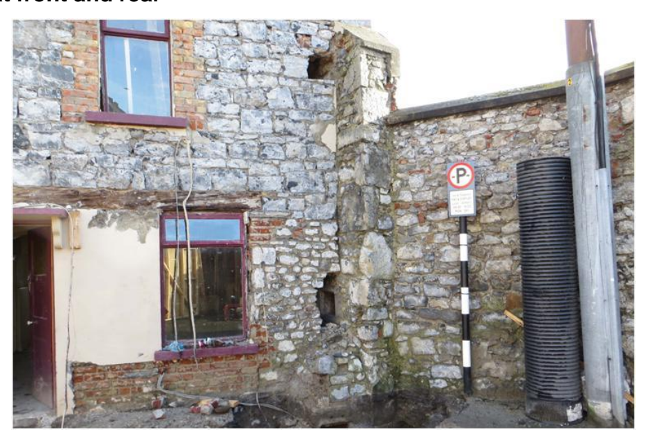
Plate 3: Buttress at front of 22 Vicar Street

A feature similar to a buttress projects from the front of number 22, at the right-hand or southern end. The investigations showed that the front wall of number 22 is built up against the gable end wall, showing that the front wall was built later. The buttress is the end of that gable wall and is built of rubble, some of the stones of which are clearly reused as they have lime-wash on the surface, while other stones do not. There is a significant amount of brick between the stones, suggesting that this end of the gable wall dates from the eighteenth century or later.