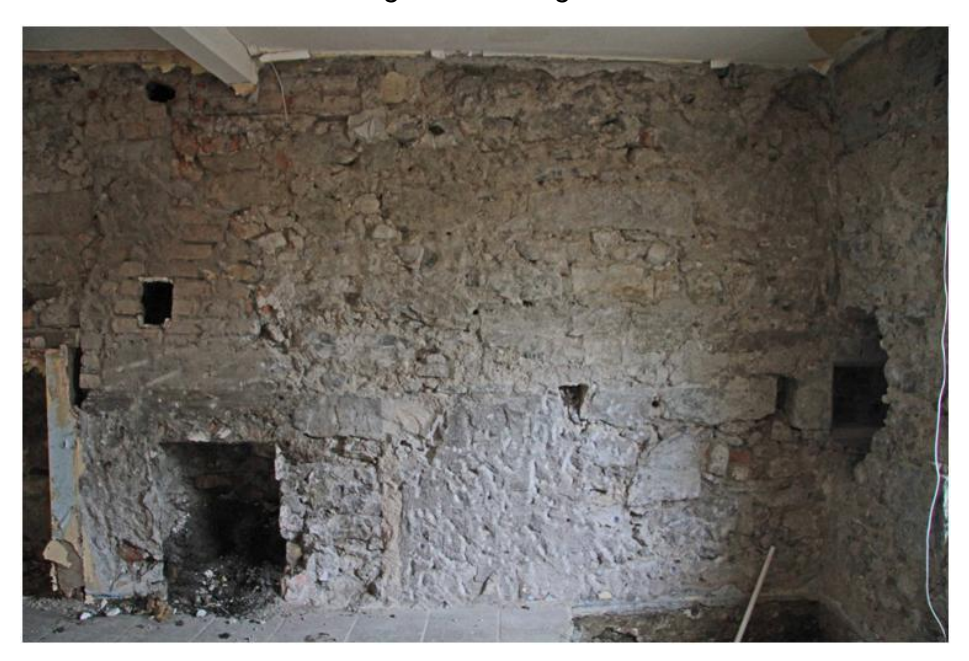
Plate 10: Interior of gable wall at ground floor - right

The interior of the gable wall at ground floor level has had three fireplaces, in addition to the one in the adjacent wall that was blocked up, and which is pictured in plate 7 above. All three are intrusions into the original wall. Those parts of the wall that have not been affected by these alterations are comprised of rubble limestone. There are fragments of brick through much of the wall, indicating that this wall is not medieval. The fragments are mostly too small to be sure what size the original bricks were and so cannot show whether the wall is seventeenth century or whether it is later. The fireplaces are discussed further below after consideration of the first floor.