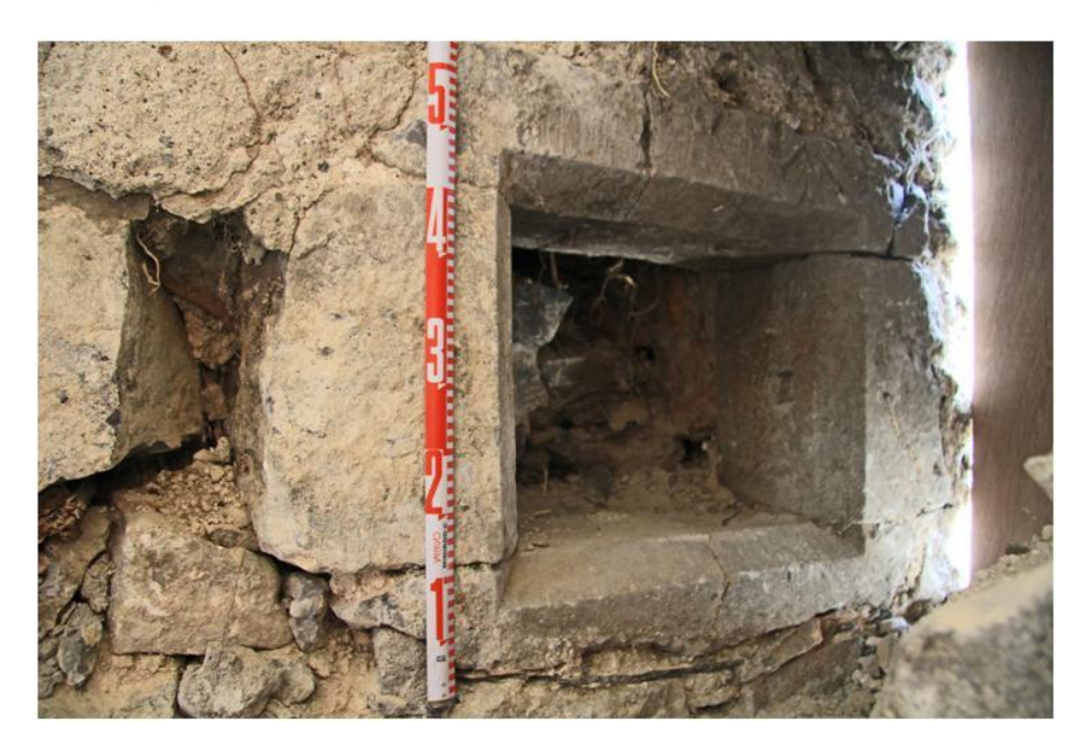
Plate 8: Stone-lined opening in gable wall

The removal of plaster from the walls in the large room at ground floor level revealed a cut stone in the corner of the room. The stone was in the end gable wall, but was partly hidden by the front wall of the house. When stones were removed from the front wall a stone-lined opening was revealed. This consisted of four cut stones with bevelled edges forming the sides of a rectangular opening. Square recesses in the inward-facing sides of the stones would have held bars, with two vertical bars and one horizontal. This opening appears to be a small window