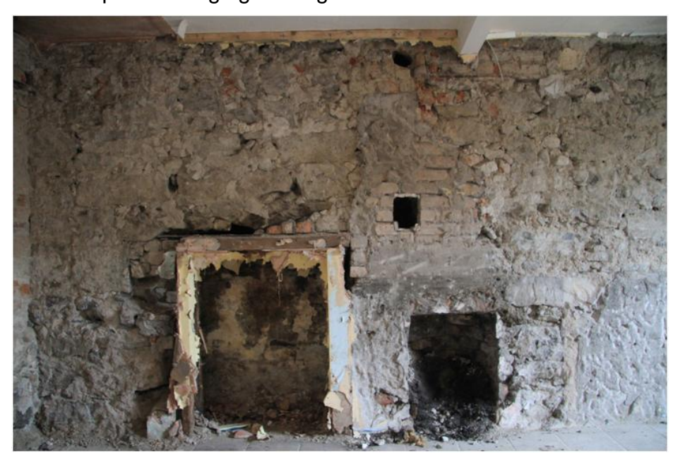
Plate 9: Interior of gable wall at ground floor - left

The southern end wall of number 22 Vicar Street can be seen in the main ground floor room and in the two rooms above it, while its southern face is seen in the adjacent yard or car park belonging to Diageo Ltd.