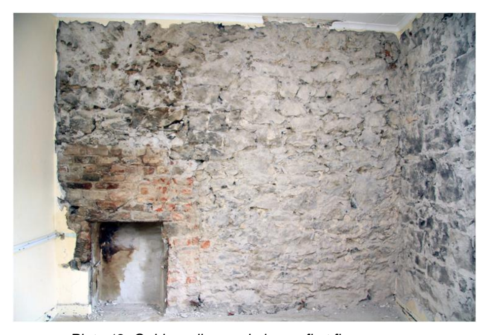
Plate 12: Gable wall, seen in larger first floor room

The gable wall in the first floor rooms is built with limestone rubble. There is a small amount of brick in this wall, and as with the ground floor the fragments are too small to indicate what size they were originally. This wall has a fireplace inserted into the centre, with a brick surround. This is discussed further below. The masonry in the main part of the wall is roughly coursed in the left-hand section, over the hearth and in the left-hand room, while the masonry to the right of the fireplace is not coursed. This suggests a possible difference in dates between the two ends of the wall.