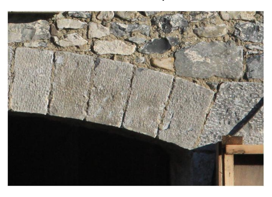
Plate 6: Cut stone in the arch over the carriageway

Some cut stone found during the works is in its original location and was provided as new stone during the construction of the houses. Cut or dressed stone was common in buildings until the late nineteenth century at the corners of buildings, chimneybreasts and arches. These are frequently found at railway bridges from the 1830s to the 1890s.