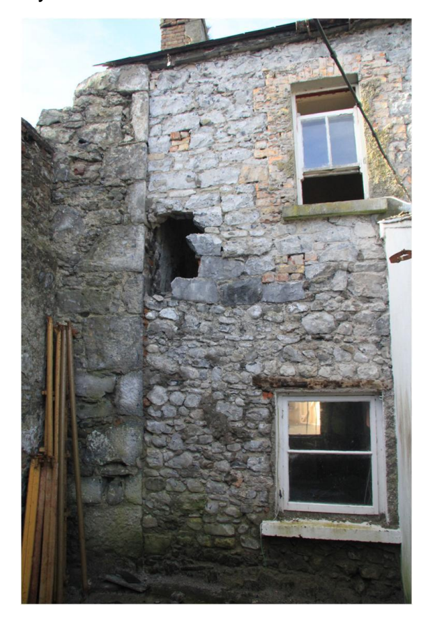
Plate 4: Corner embedded at rear of house

At the back of number 22 the opposite end of the gable wall was revealed when the render was removed. This is not a projecting buttress at the rear, but the corner of a building, embedded in the wall at the end of the rear facade. There are some large stones in this corner, including some that have been dressed, one of which is clearly part of a door or window jamb from the late medieval or early modern period. It is not in its original location, however, and represents the reuse of the stone from some other building. There is a significant amount of brick between the stones of this embedded corner, indicating that it dates from the eighteenth century or later. The rear wall of the house is butted against this feature, showing that it is of later date.