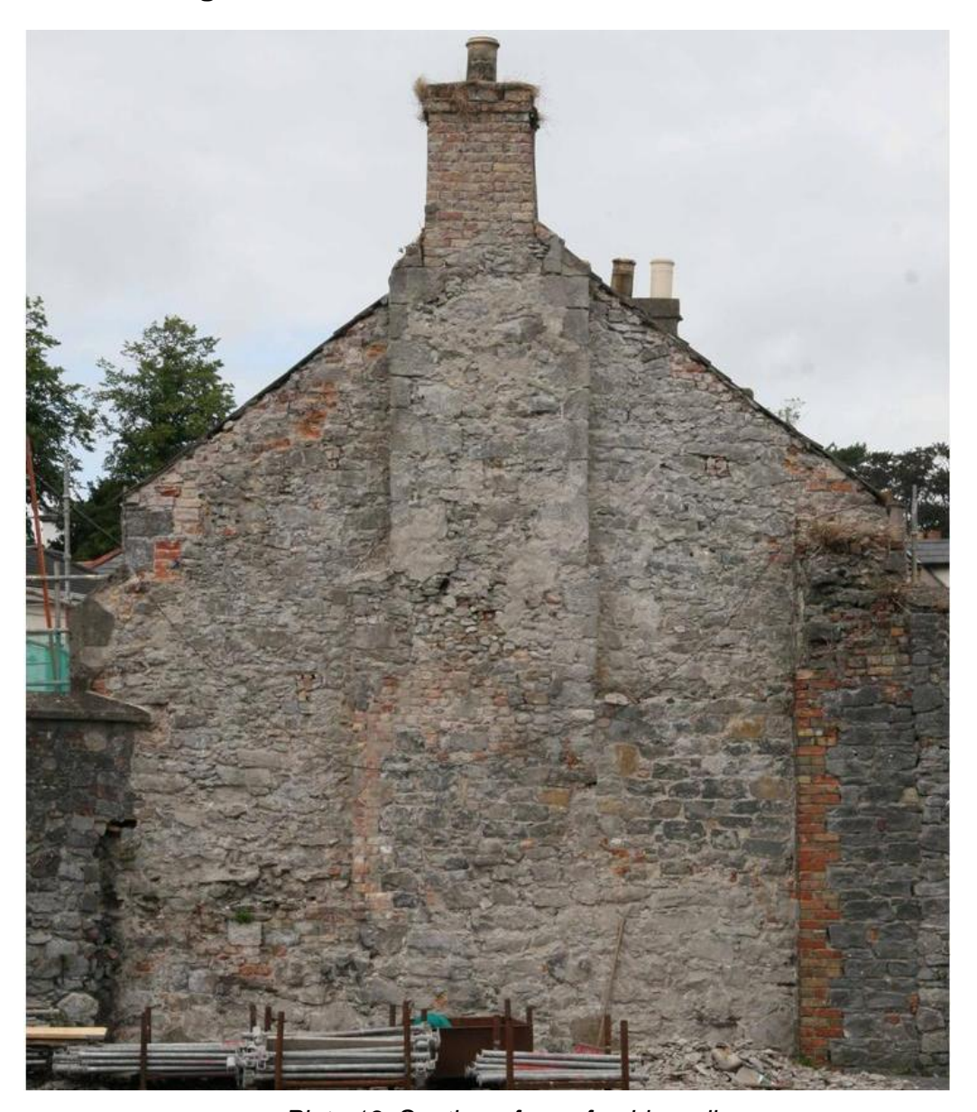
Plate 13: Southern face of gable wall

The southern side of the gable wall, which is the external face, forms part of the northern boundary of the yard or car park owned by Diageo Ltd. As has been noted, this wall is earlier than the present house at 22 Vicar Street and the front and back walls of the house were built up against it. The projecting buttress on the front of number 22 and the embedded corner at the rear of the house have been described above and these are strong indications that this gable wall formed part of an earlier structure that stood on the land now occupied by the Diageo yard. At the right-hand side of the photograph above the column of darker stone, edged with brick, represents a twentieth-century facing onto the rear corner of the building, which is the corner that is embedded at the rear of number 22.