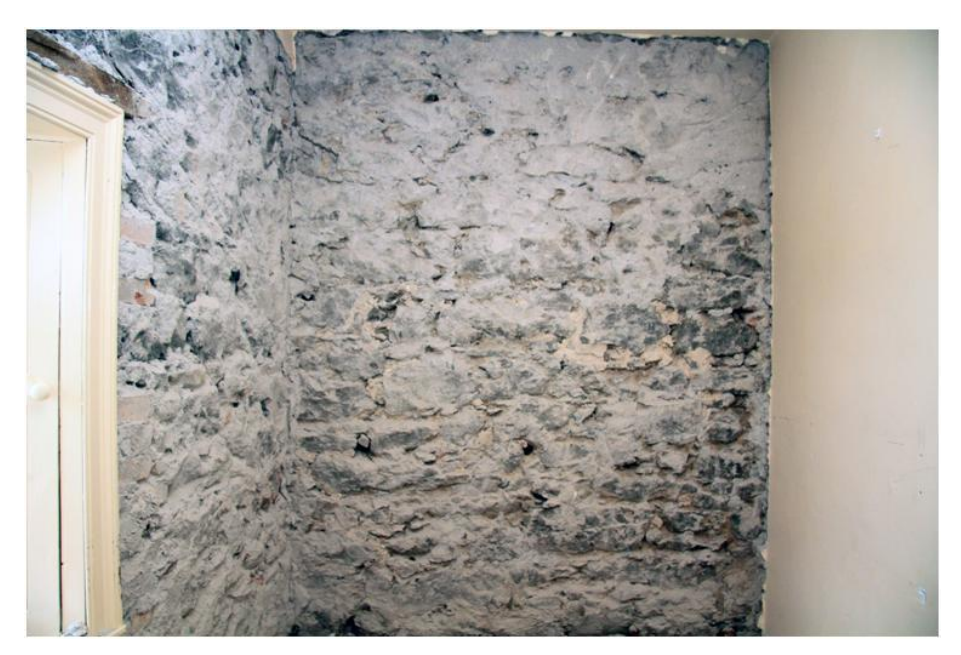
Plate 11: Gable wall, seen in smaller first floor room

The first floor is divided into two rooms by a timber partition. The section of the partition near to the gable wall was removed to allow for full examination of the masonry in the wall.