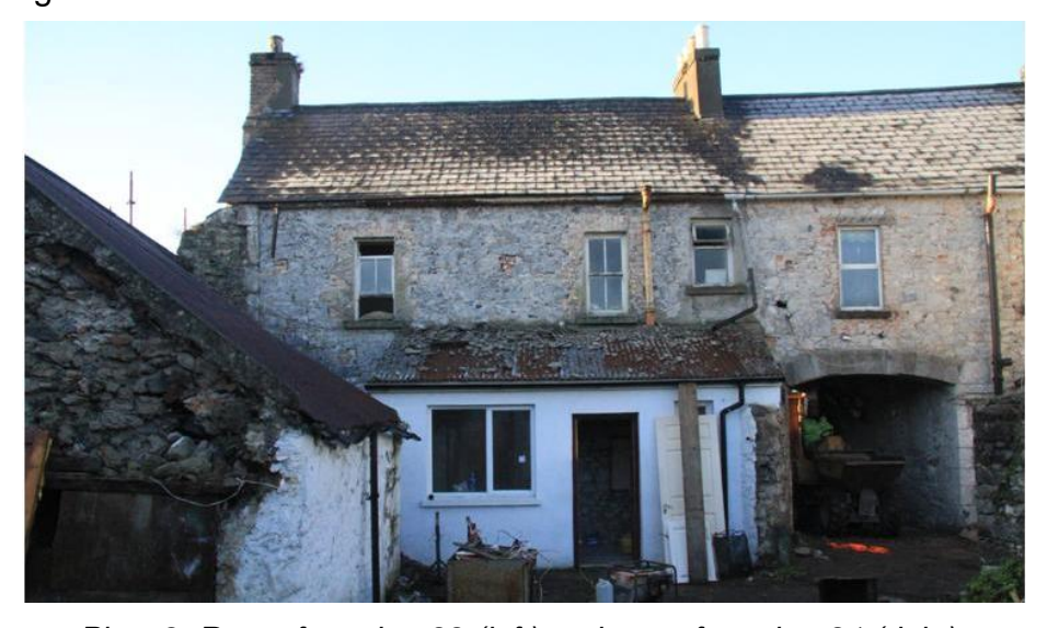
Plate 2: Rear of number 22 (left) and part of number 21 (right)

The photograph above shows the front facade of number 22 and most of number 21 after the removal of the render from the front facade. The red brick around the windows of number 22 is typical of the early twentieth century and dates from the reconstruction in 1908. The majority of the stone in the facade is from the same period, though some at the very bottom to the left of the door is earlier – possibly as early as the eighteenth century, but not earlier. The brick around the windows in number 21 is typical of the later nineteenth century, which is consistent with the date of 1881 for this building. Both houses have areas of concrete on their facades, representing the work carried out in the 1930s.