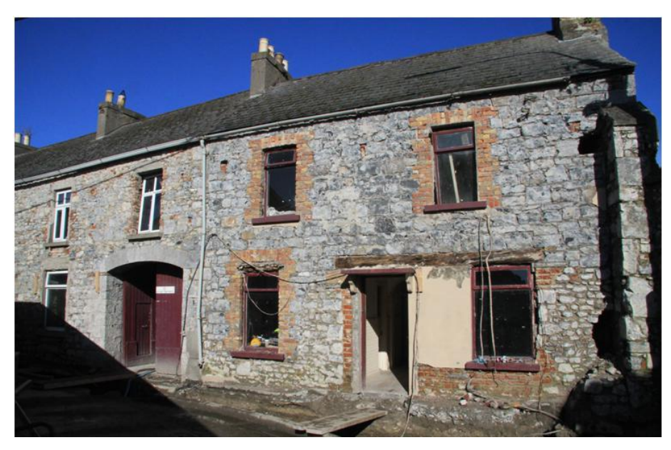
Plate 1: Front of numbers 21 (left) and 22 (right)

The photograph above shows the front facade of number 22 and most of number 21 after the removal of the render from the front facade. The red brick around the windows of number 22 is typical of the early twentieth century and dates from the reconstruction in 1908. The majority of the stone in the facade is from the same period, though some at the very bottom to the left of the door is earlier – possibly as early as the eighteenth century, but not earlier. The brick around the windows in number 21 is typical of the later nineteenth century, which is consistent with the date of 1881 for this building. Both houses have areas of concrete on their facades, representing the work carried out in the 1930s.