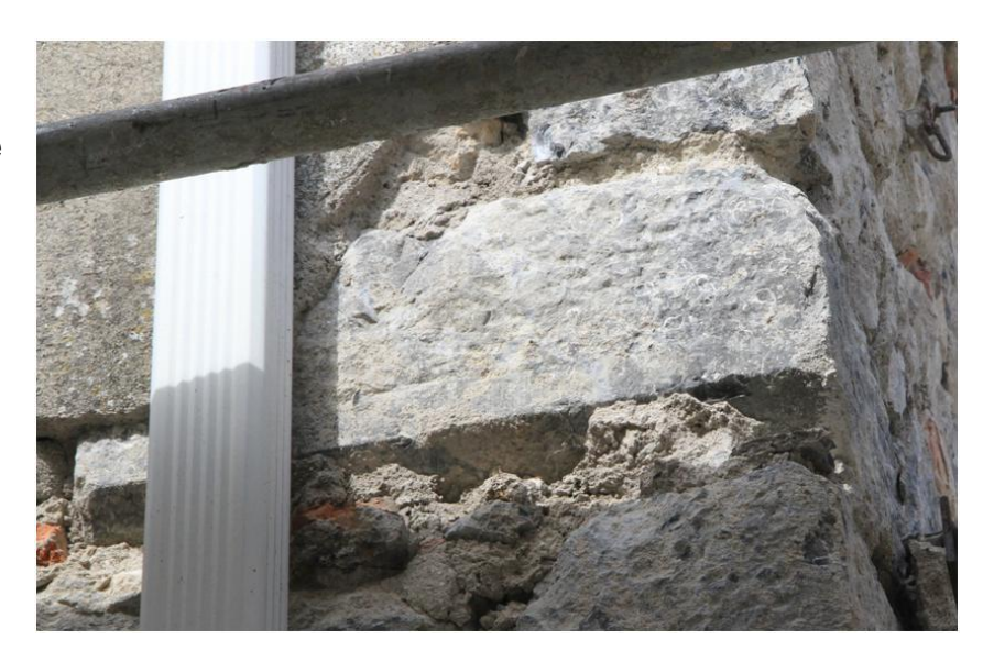
Plate 5: Chamfered stone window or door jamb in return at rear

Several stones built into the walls were found to have been cut or dressed and some of these were of late medieval or early modern date. In all cases they appear to have been salvaged from an earlier building and reused. The adjacent photo shows a stone that may be medieval and which is built into a wall that was built in 1881.