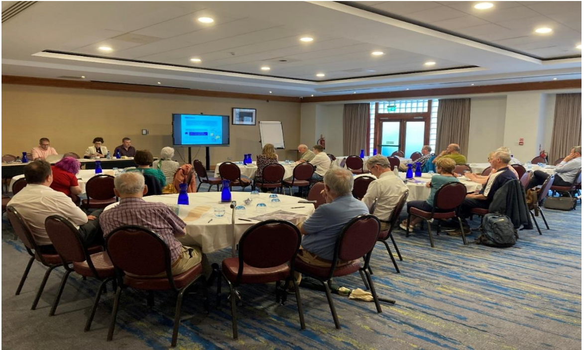
Members of the public attending the first in person event