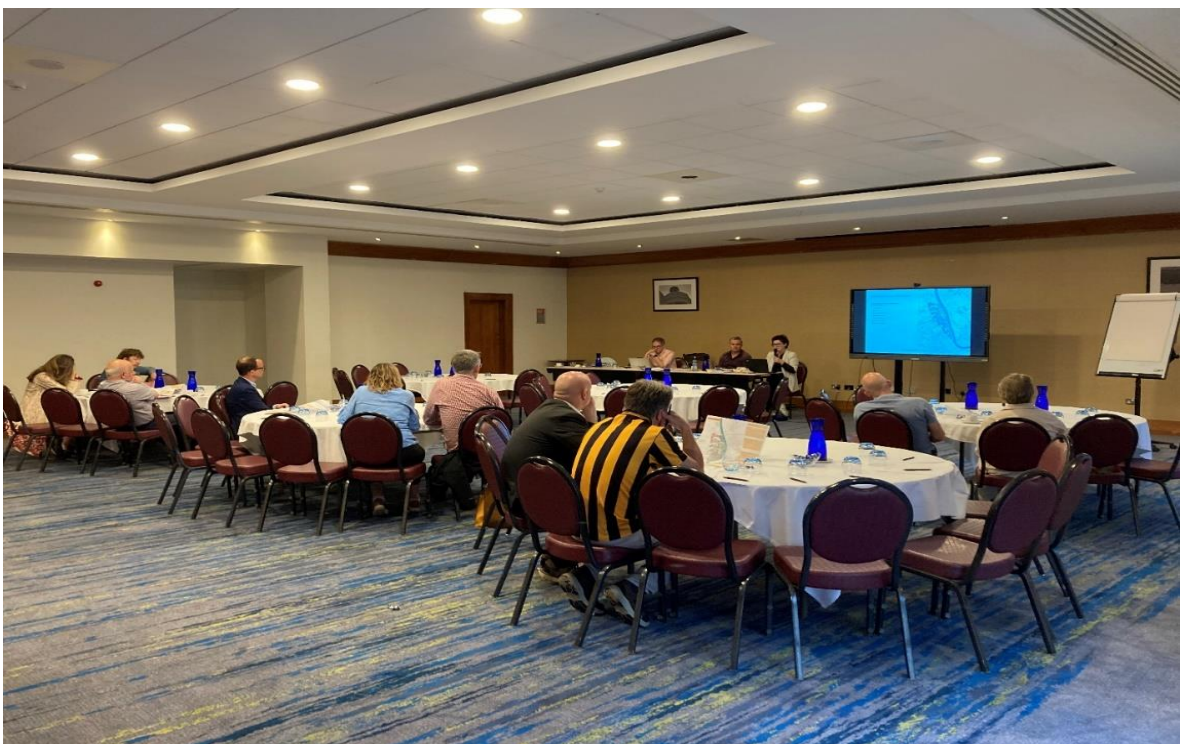
Members of the public attending the second in person event